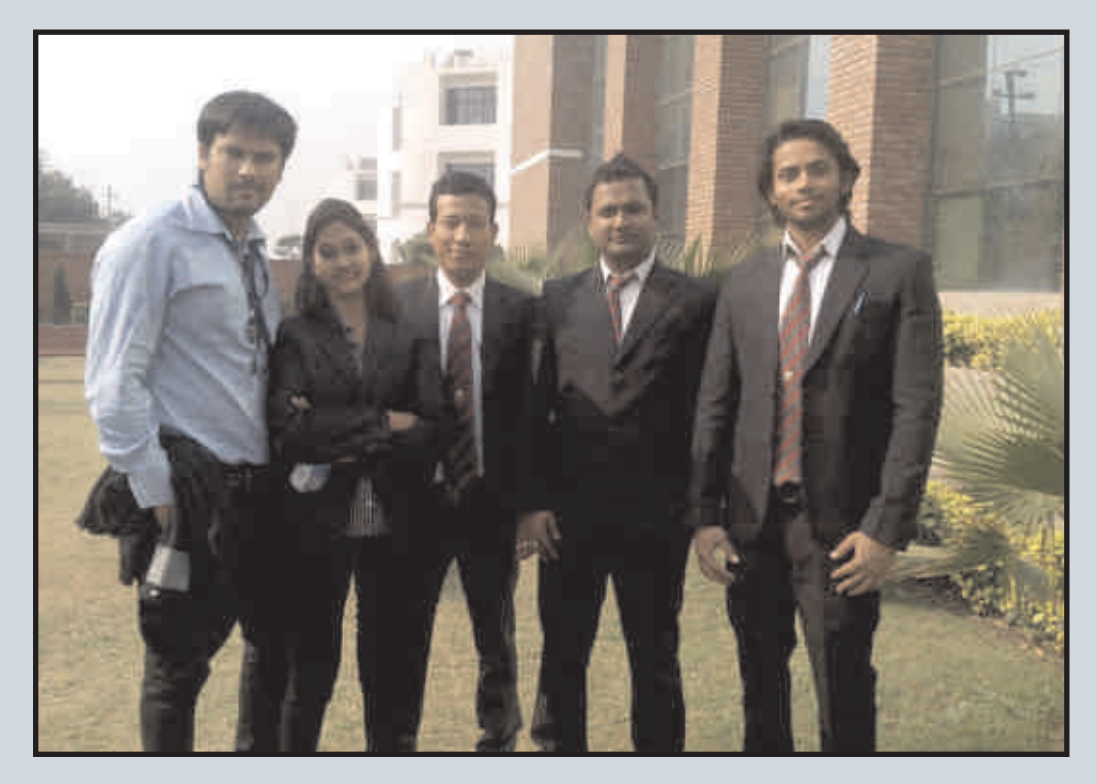
Empowered to Perform Under Pressure - Hierankers

"Enhancing all round competence of students by cultivating them to become real global resources having faith in themselves and their values."